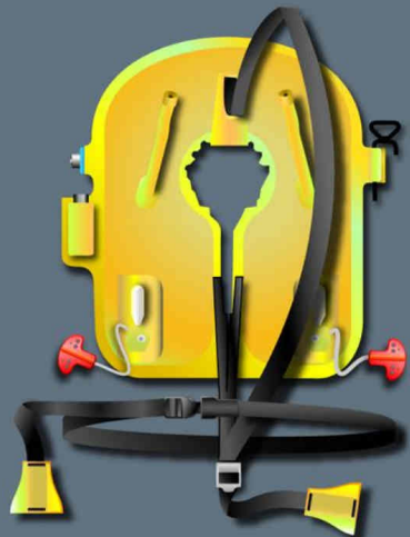
Demonstration Life Vest