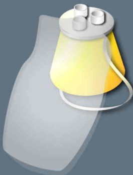
Demonstration Oxygen Mask